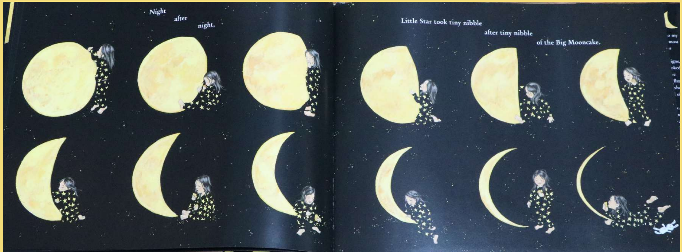
Image from the book – Little Star eating the mooncake which shows readers the phases of the moon.

*There are also great discussion questions, vocabulary and lesson plans, DIY activity and teacher guides, at this link.