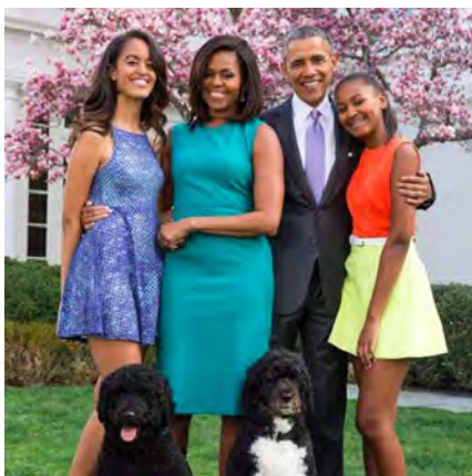
The Obama Family