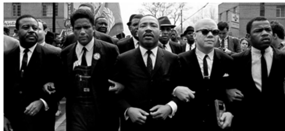
Marching with Dr. King