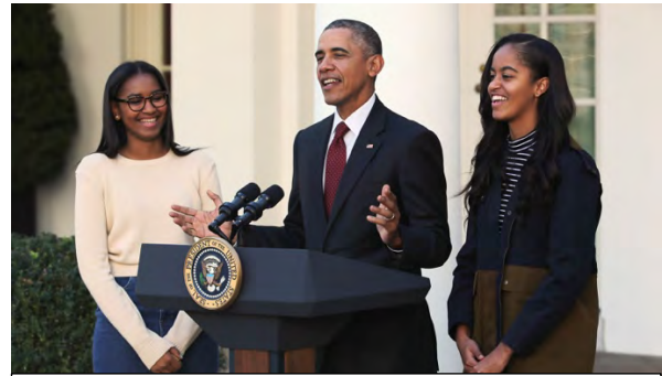
With his Daughters, Malia and Sasha

Barack Obama is the first African American President of the United States (2009 – 2017).