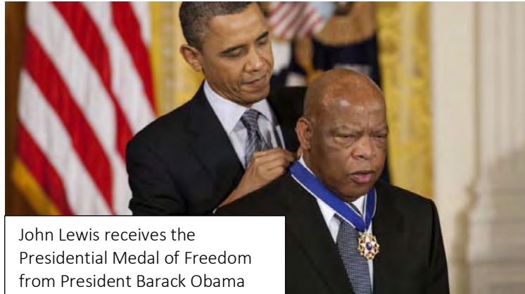
John Lewis receives the Presidential Medal of Freedom from President Barack Obama

In 1965 Lewis led more than 600 peaceful protestors across a bridge in Selma, Alabama, in response to local violence against civil rights activists. The Edmund Pettus Bridge. The protestors were attacked by law officers, and more than 50 people, including Lewis, were hospitalized. The day became known as “Bloody Sunday.” The event helped pass the Voting Rights Act, which outlawed the many ways used to prevent African Americans from voting.