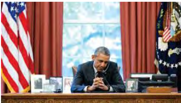
In the Oval Office at the White House

Check out these links for more information on Barack Obama: https://www.ducksters.com/biography/uspresidents/barackobama.php https://kids.kiddle.co/Barack_Obama https://www.obama.org/