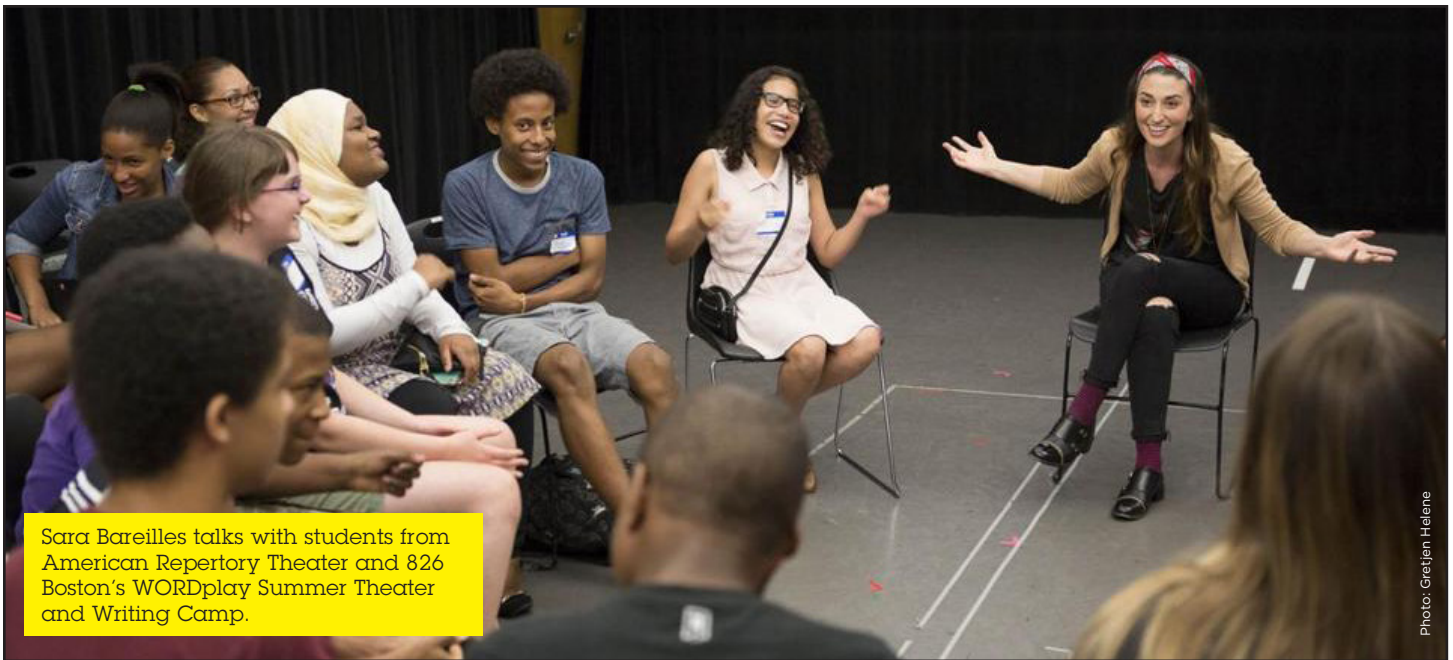
Sara Bareilles talks with students from American Repertory Theater and 826 Boston's WORDplay Summer Theater and Writing Camp.