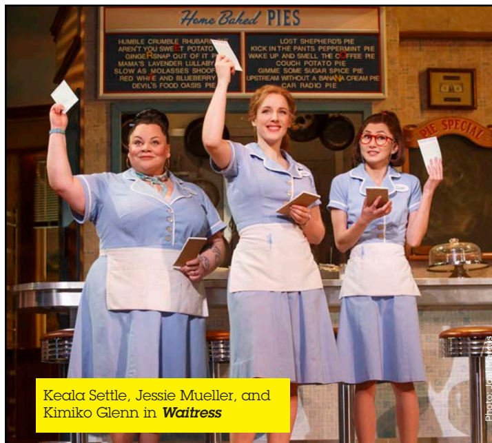
Keata Settle, Jessie Mueller, and Kimiko Glenn in Waitress

When diners first popped up in America, servers and short-order cooks quickly developed their own code words and phrases for the food and people in the diners. Below are a few classic diner lingo terms and what they mean.