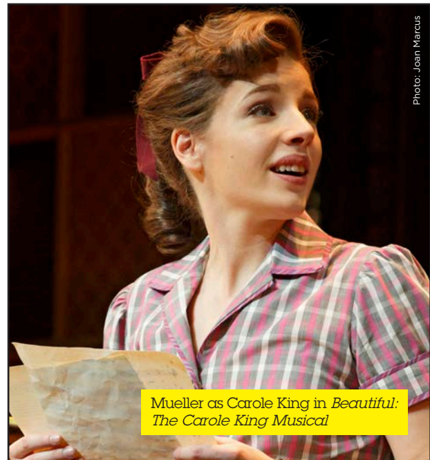
Mueller as Carole King in Beautiful: The Carole King Musical .