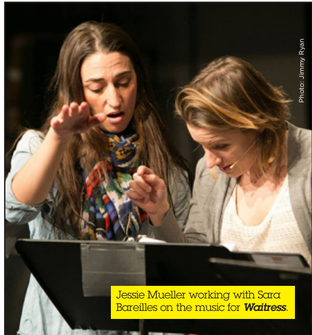
Jessie Mueller working with Sara Bareilles on the music for Waitress .

The daughter of two actors and sister of three siblings who are also all performers, Mueller grew up in suburban Chicago surrounded by theater. She never felt pressured by her family to perform, but was attracted to the process and culture of theater. “It was my parents’ job and I understood there was a lot of work involved from an early age,” she remembers. “But I also saw the camaraderie. I saw my parents’ friends with them after a show. I saw that world – it’s unlike anything else.” Mueller began acting in high school, and later studied theater as an undergraduate at Syracuse University. Returning to Chicago after graduation, she was quickly recognized for her remarkable voice and captivating stage presence. Within a year, Mueller landed a role at the Chicago Shakespeare Theater, and then continued to perform at many of Chicago’s leading theaters, winning her first Joseph Jefferson Award in 2008 in Carousel and another in 2011 in She Loves Me . In