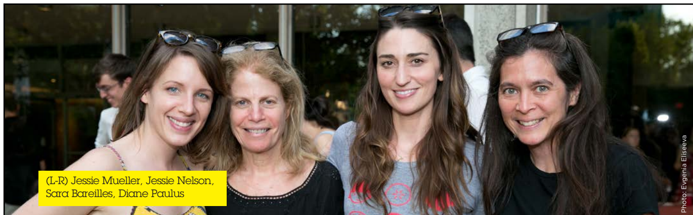
(L-R) Jessie Mueller, Jessie Nelson, Sara Bareilles, Diane Paulus

Waitresses work across the entire American landscape. We asked members of the Waitress team to share some of their own experiences as, or with, waitresses and waiters.