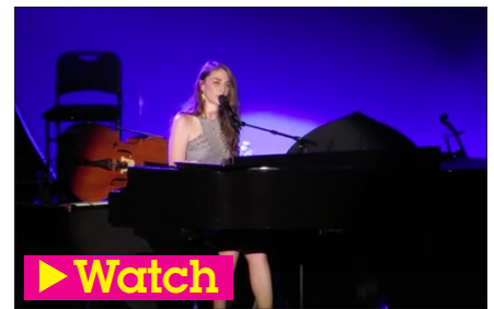
▶ Watch Sara Bareilles sings “She Used to Be Mine” in concert

She is messy but she's kind She is lonely most of the time She is all of this mixed up and baked in a beautiful pie She is gone but she used to be mine.