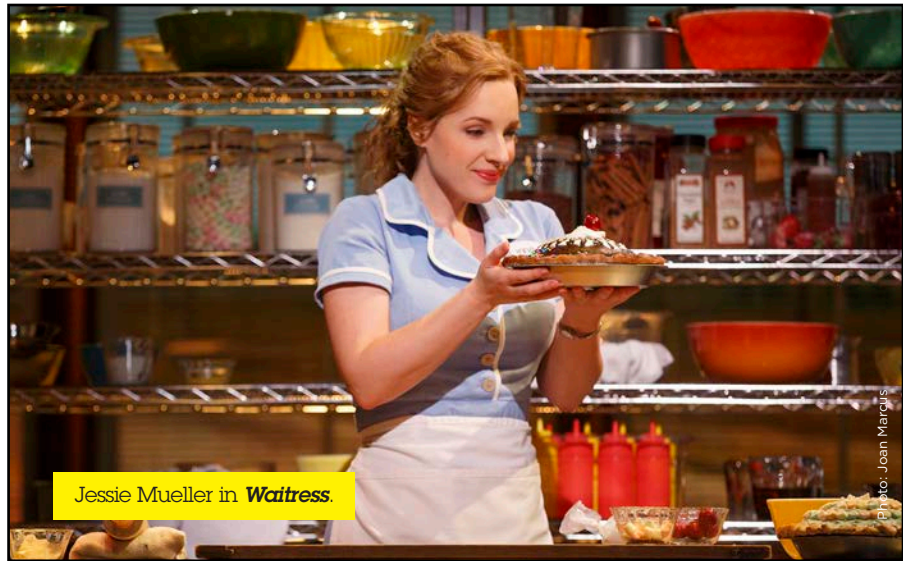
Jessie Mueller in Waitress .

An inquisitive actress who is deeply inspired by the developmental process, Mueller’s exploration of her character’s psychology and voice in rehearsal is invaluable. She explains that the relationship among Waitress director Diane Paulus, book writer Jessie Nelson, and composer Sara Bareilles has influenced her own collaborative approach to new work. “I like the way those ladies all work together,”